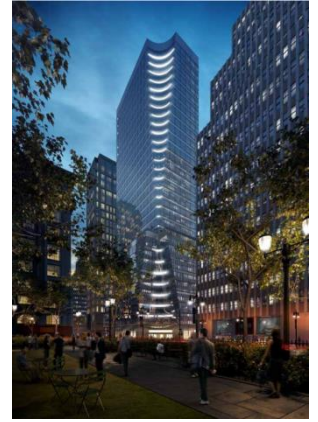
Figure 1: Image courtesy of Hines

Analysis 1 will focus on the opportunity to change the current formwork system that is being used on the project. A guided formwork system is currently being used to cast the system. While this system is quick and efficient, there are always safety concerns and crane-time is needed to lift the form. This analysis will research the use of a self-climbing system and an analysis of the cost and schedule impacts will be conducted.